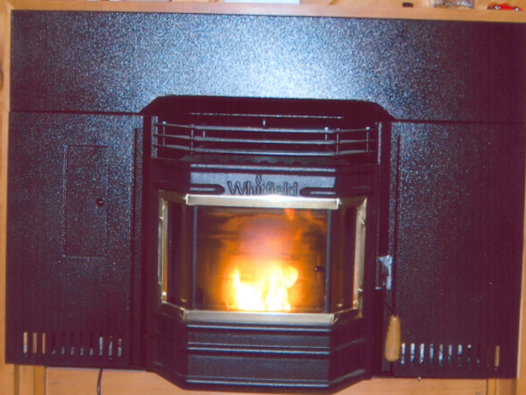
Figure 35 - Normal Insert Installation